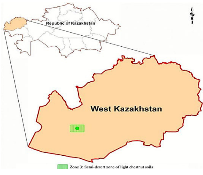
Figure 1. Location of the study sites

Reduction of reserves of humus in the 0–30 cm layer of the figure in the control plot, in percent (%);